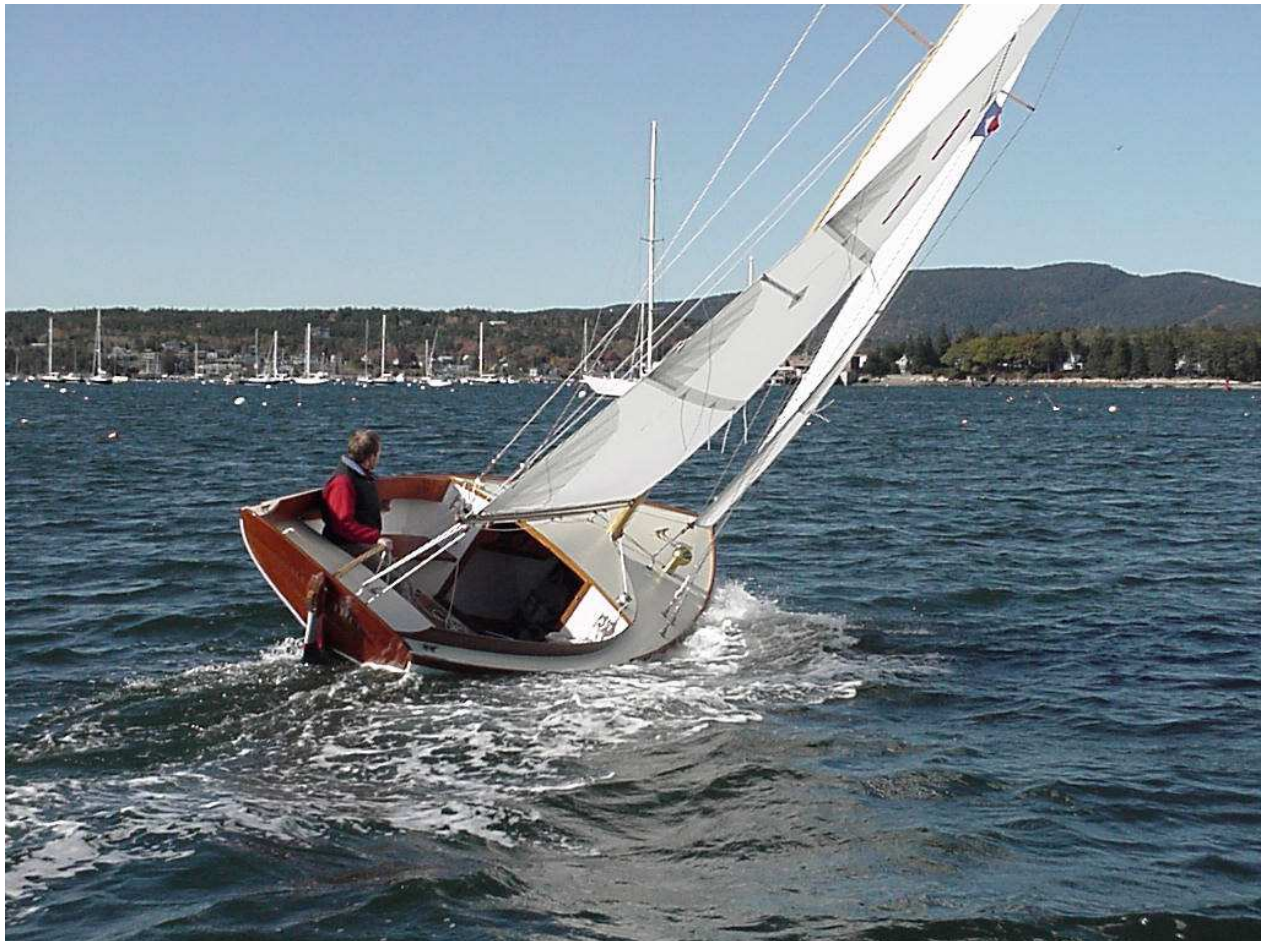
Hull number one, Serendipity, beating to windward on a blustery fall day.