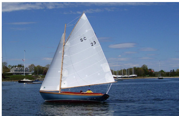
We designed a gaff rig for the Pisces in 2006. These have become a separate racing class at the Seawanbeka Corinthian Yacht Club.