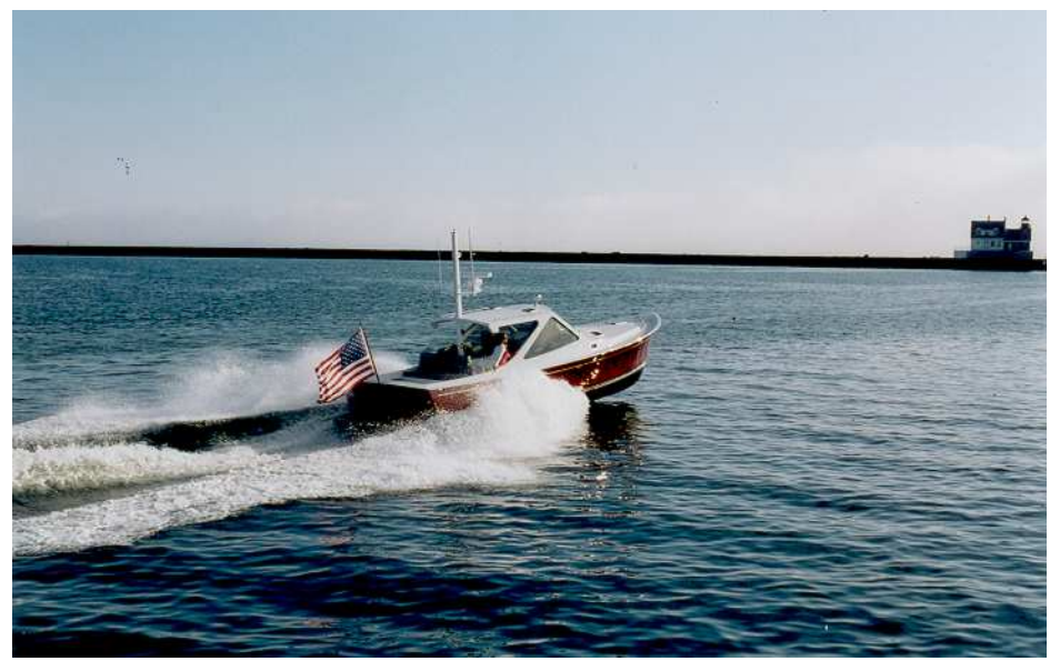
PATRICK WILMERDING'S DUCK SOUP USES A SINGLE CONVENTIONAL ENGINE AND PROPELLER