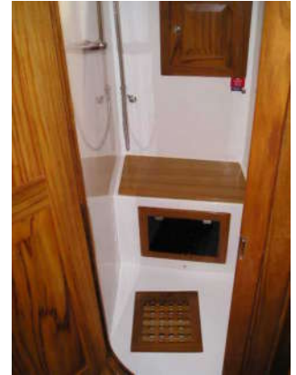
SHOWER STALL & SEAT

The interior is fitted in a thoroughly traditional fashion into a hull of such size that it permits all tankage to be located down in the keel, freeing up the more easily accessed areas for personal stowage- very rare in a 42 foot yacht. There are two distinctly separate double cabins, one forward and one aft. But the real genius of this design is the third cabin, which may be custom ordered as either a third sleeping cabin, office, laundry, or whatever a prospective owner can think of. The full galley offers lots of countertop space and an unusual amount of stowage outboard. There are two private heads and a separate shower stall. The standard of finish of all Cabo Rico yachts is superb, taking advantage of a lovely honey colored teak which is available only in Costa Rica, in addition to a highly skilled labor force. Best of all, somewhat lower labor costs than are the norm domestically enable Cabo Rico to lavish manhours on their yachts with the result that the interiors are positively dripping with sumptuous hand rubbed opulence - a fitting reward for a successful life before casting off the cares and sailing away- all at a price that is unrealistically affordable thanks to the Costa Rican labor content.