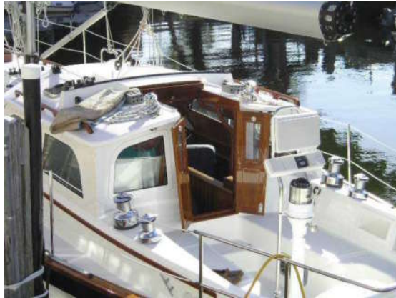
COCKPIT AND COMPANIONWAY SHOWING DOORS RATHER THAN DROP BOARDS FOR EASY ACCESS