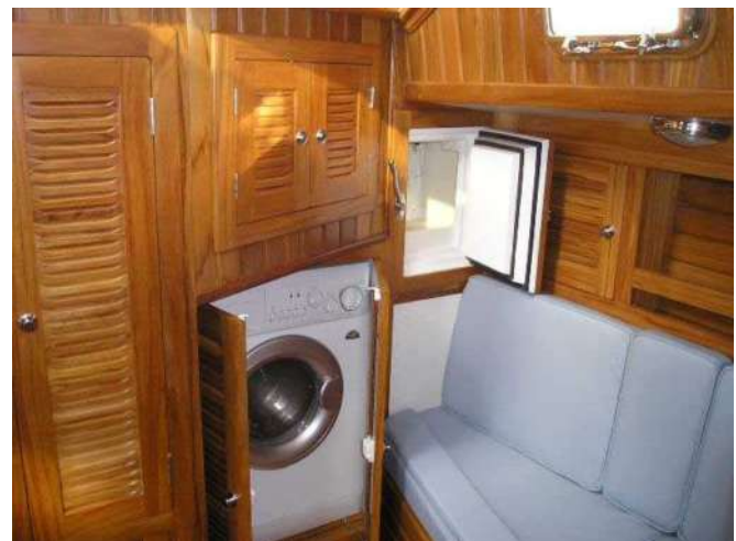
LOUVERED DOORS EVERYWHERE AND LOVELY JOINERWORK