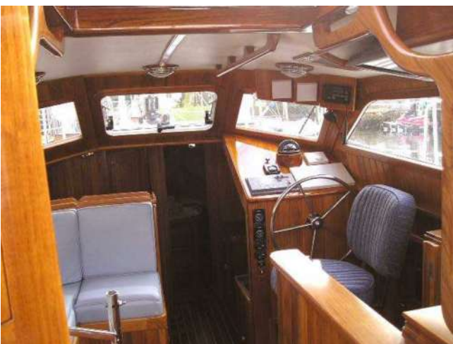
THE PILOTHOUSE IS LARGE AND COMFORTABLE

The deck design is tried and true. There are bulwarks completely surrounding the working deck for onboard security. All windows forward of the pilothouse are opening ports, and are located at a height that permits easy viewing of the surroundings. The mainsheet traveler is mounted safely out of harm's way atop the pilothouse. Beautifully sculpted cockpit seats with high seatbacks make seating extremely comfortable. The combination of roof mounted handrails and lifelines provide real security going forward. There are two access hatches to the aft lazarette and a single large gas stowage locker, as well as a good sized cockpit seat hatch to port, so deck accessed stowage is simply unmatched.