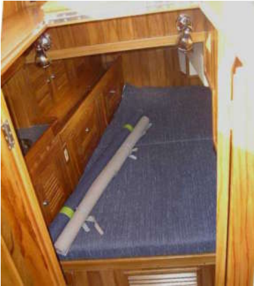
AFT CABIN FROM PILOTHOUSE

decked 42, and as experienced yachtsmen are aware the yacht is genuinely fun to sail, fast for a yacht of her weight, a delight to helm, and extremely ruggedly built.