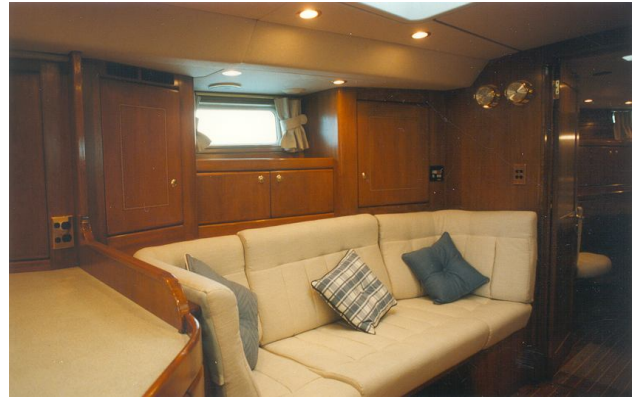
A comfortable sofa in the main cabin.