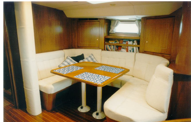
A large enough dinette to accommodate the whole crew.