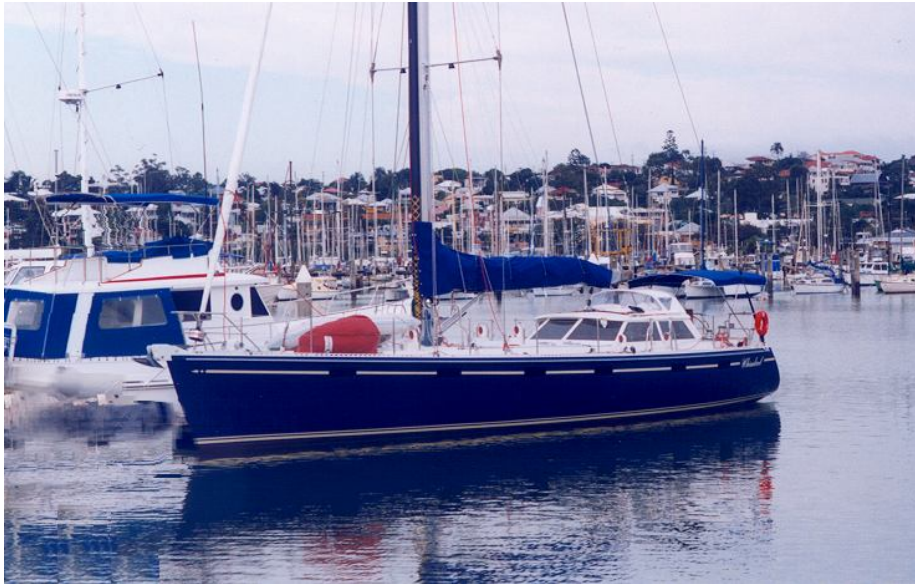
WHIMBREL after her fast maiden sail from Australia to England.