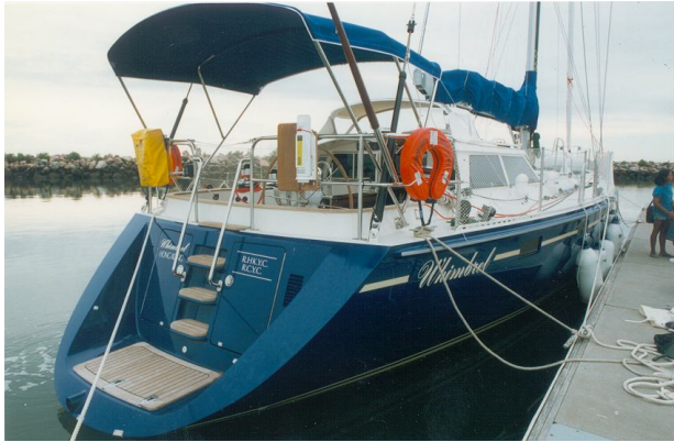
The "scoop deck" swimming/ boarding platform.