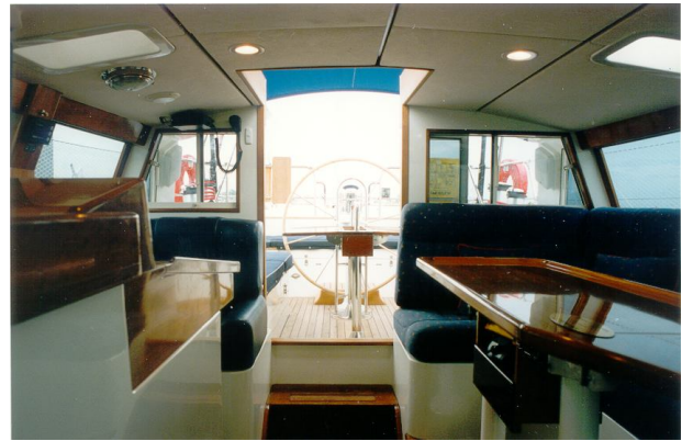
Looking aft through the pilothouse.

It's interesting to me how one length—62 feet—attracted so many Bermuda Series customers. During the 1990's we were the designers of ten custom yachts of very similar design at this length. Though there were dignificant differences in the deck and interior designs these yachts had essentially the same hull. This hull must have hit a "sweet spot" in terms of performance, interior volume and perceived value. These yachts were capable of reliable 200 mile days at sea, yet were not so large as to require paid help to maintain and push away from the dock. Their sailplans were small relative to the length of their hulls, so they weren't visually intimidating. And their interiors, as illustrated here, were sufficiently similar to a terrestrial home to enable the wives to go along with the program.