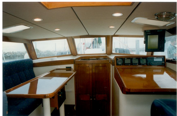
The entirely self-contained pilothouse .