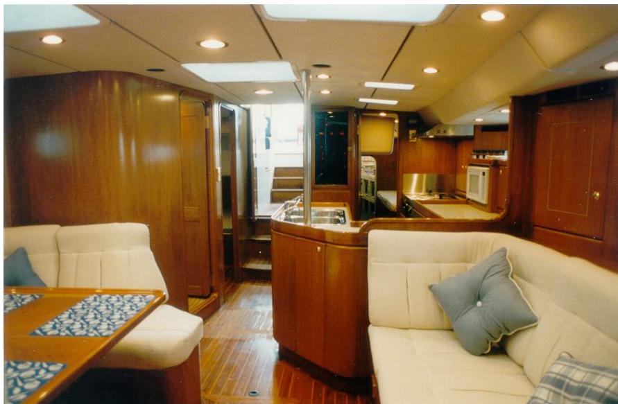
A nice home for a voyage around the world.