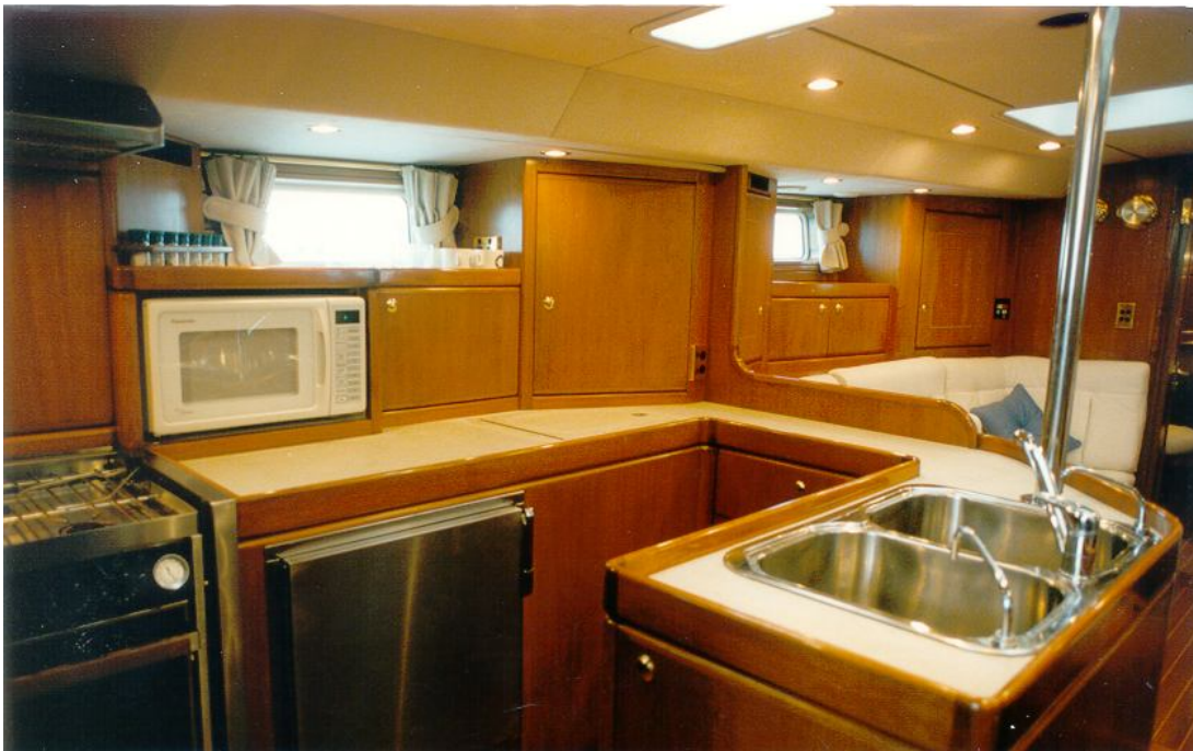
European cabinetry styling built with skilled Australian labor.