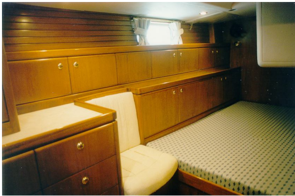
The aft cabin had plenty of stowage.

It's interesting to me how one length—62 feet—attracted so many Bermuda Series customers. During the 1990's we were the designers of ten custom yachts of very similar design at this length. Though there were dignificant differences in the deck and interior designs these yachts had essentially the same hull. This hull must have hit a "sweet spot" in terms of performance, interior volume and perceived value. These yachts were capable of reliable 200 mile days at sea, yet were not so large as to require paid help to maintain and push away from the dock. Their sailplans were small relative to the length of their hulls, so they weren't visually intimidating. And their interiors, as illustrated here, were sufficiently similar to a terrestrial home to enable the wives to go along with the program.