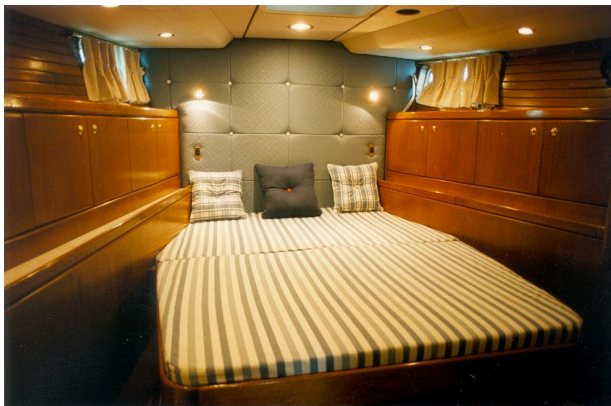
The sumptuous guest cabin.

The most interesting sistership had a large dinghy well aft for a 14-foot outboard boat. It was winched out of the water on rollers similar to those on a boat trailer.