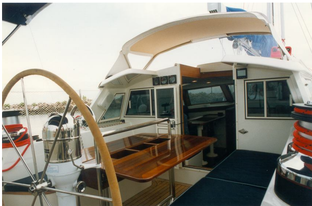
Nice shelters aft of the pilothouse.