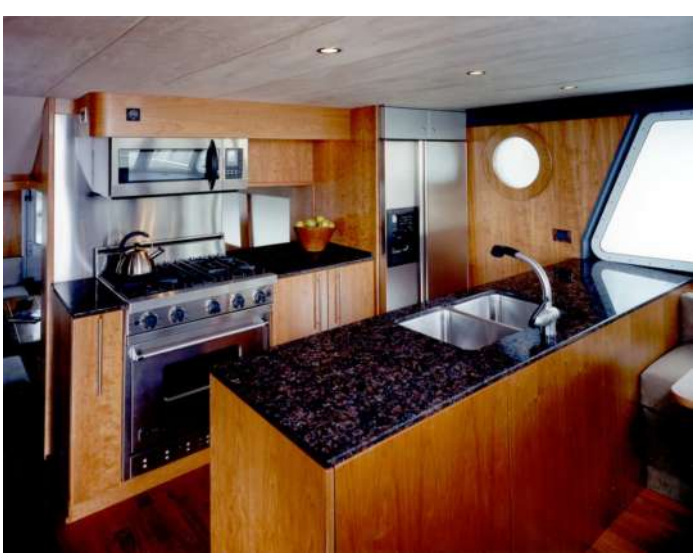
LOVELY JOINERWORK AND THE HIGHEST QUALITY APPLIANCES