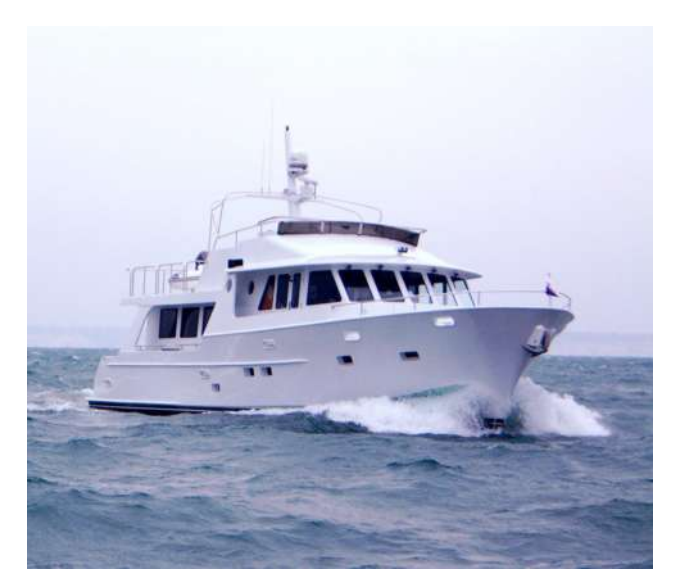
EXCELLENT SPEED AND LONG RANGE

The Kanter 62 is built in Canada of high strength welded aluminum for the ultimate in leak proof integrity and brute strength. With a modest size genset, the yacht is easily heated, air conditioned, and supplied with all of the comforts of a shoreside home. She would make an ideal choice for one or two couples intending a retirement cruise to the Caribbean or Europe. The first yacht to this design was launched in October 2002 at the Kanter yard West of Toronto. We would be happy to discuss the customization of your sistership.