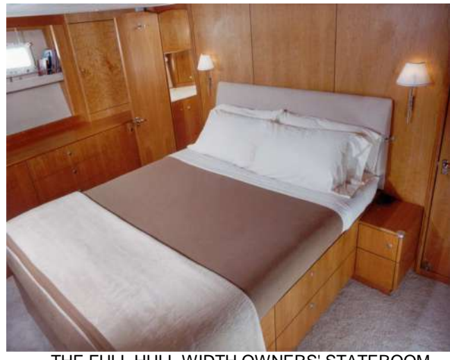
THE FULL HULL WIDTH OWNERS' STATEROOM

The Kanter 62 is built in Canada of high strength welded aluminum for the ultimate in leak proof integrity and brute strength. With a modest size genset, the yacht is easily heated, air conditioned, and supplied with all of the comforts of a shoreside home. She would make an ideal choice for one or two couples intending a retirement cruise to the Caribbean or Europe. The first yacht to this design was launched in October 2002 at the Kanter yard West of Toronto. We would be happy to discuss the customization of your sistership.