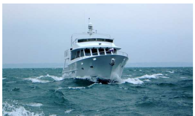
A HULL THAT IS AT ITS BEST IN ROUGH WATER

clothes storage. The centrally located shower room is truly that as opposed to the more often encountered small shower stall. The engineroom is accessed from a weathertight door via this room.