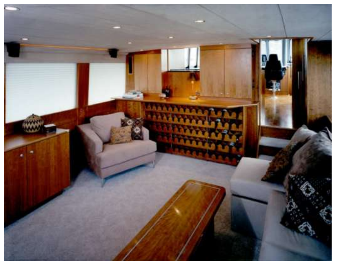
THIS OWNER CHOSE TO MAKE HIS WINE CAVE THE FOCAL POINT OF HIS MAIN SALON.