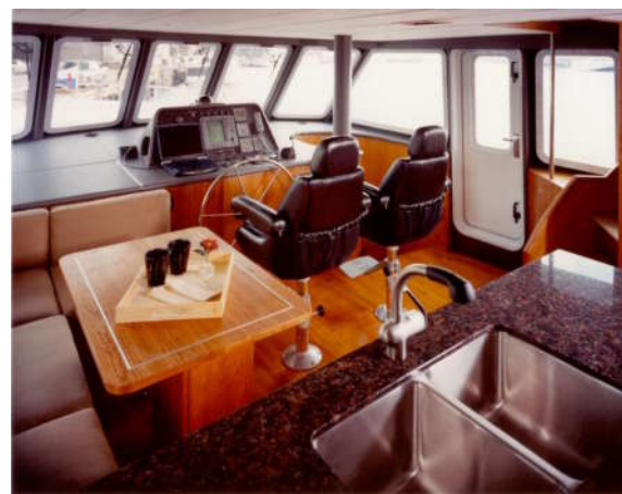
THE PILOTHOUSE HAS WONDERFUL VISIBILITY, DIRECT ACCESS TO THE DECK VIA A WATER-TIGHT DOOR, AND A DINETTE TO PORT.

The engineroom, located beneath the saloon, is extremely large and has nearly full standing headroom, permitting easy access to the machinery. FIRST STAR uses a Caterpillar 3196E 340 hp main engine and a Northern Lights 20kw genset.