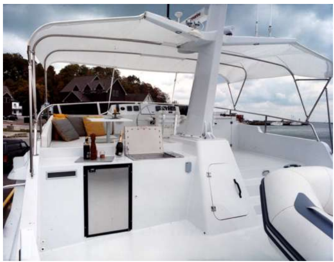
THE NICELY SHADED FLYBRIDGE FORWARD OF A BOAT DECK LARGE ENOUGH FOR ALL THE TOYS.