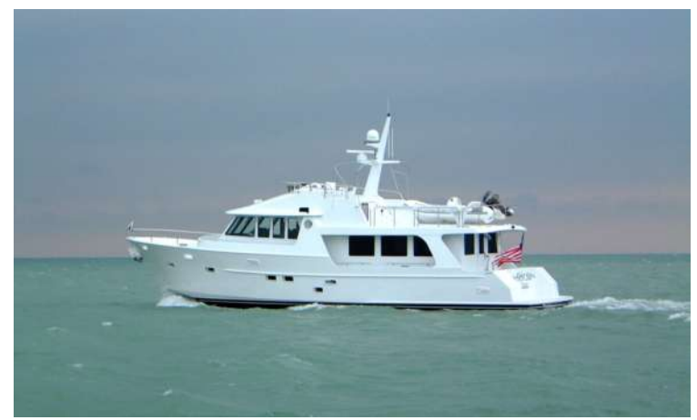
IF THE BASIC SHAPE IS RIGHT, A MOTORYACHT CAN BE TRULY GOOD LOOKING WITHOUT VARNISHED WOOD TRIM