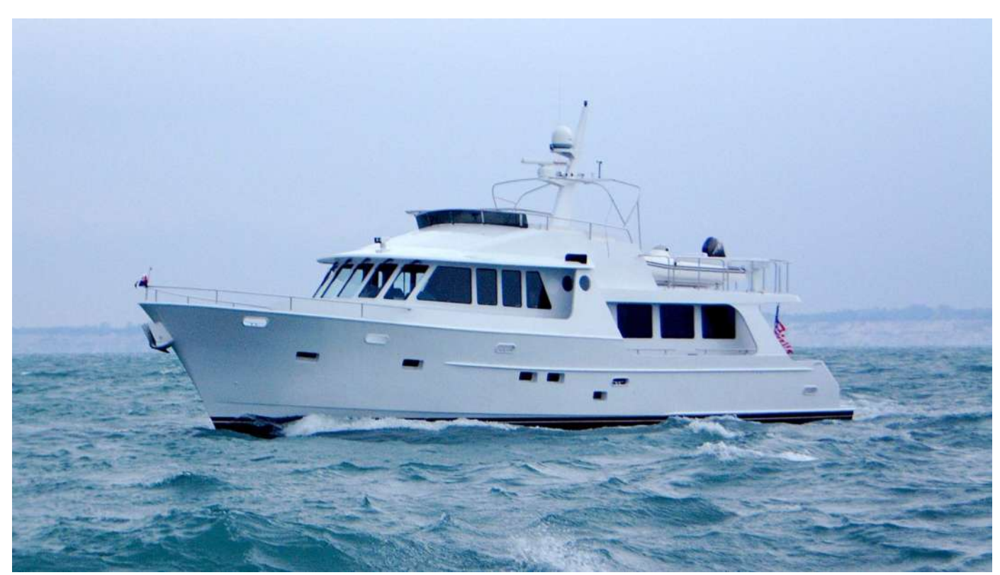
SHE COSTS LESS THAN A WATERFRONT HOME OF COMPARABLE LUXURY, AND THE VIEW MAY BE EXCHANGED BETWEEN CARIBBEAN BEACHFRONT AND THE COTE D'AZUR AT THE OWNER'S WHIM!

Builder: Kanter Yachts 9 Barrie Blvd. St. Thomas, Ontario N5P 4B9 Canada 519-633-1058 www.kanteryachts.com