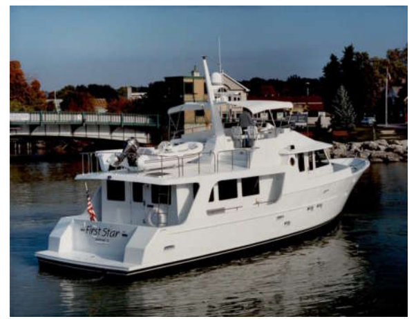
THE FIRST YACHT WAS SPECIFIED WITH NO WOOD TRIM WHATEVER FOR LOW MAINTENANCE

Tankage provides 2800 gallons of fuel and 500 gallons of fresh water. These tanks are all integral, lending further structural strength to the hull and forming a double bottom wherever they occur. The day tank, waste and gray water tanks are of removable construction. The yacht as specified has transatlantic range via the Bermuda/Azores route if driven at a speed of 9 to 10 knots depending upon wind and current conditions.