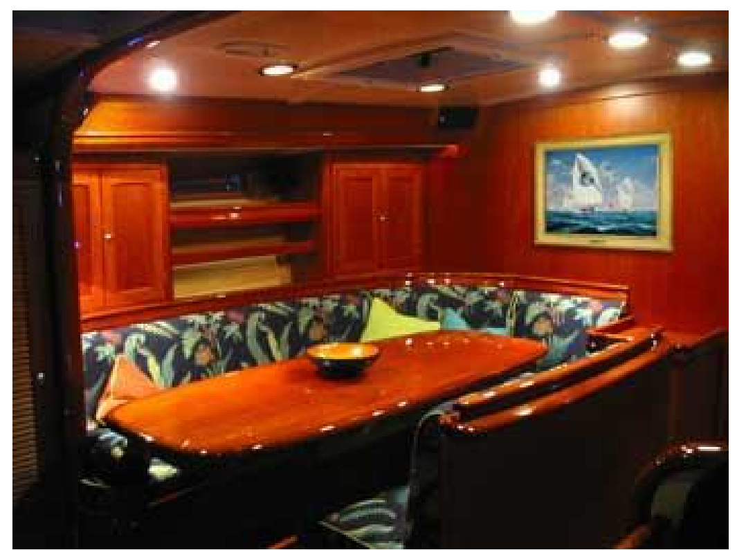
The main salon is finished in beautifully matched Honduras mahogany.