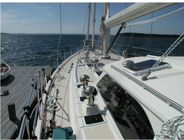
Two dorades and three opening hatches per side abreast the pilothouse ventilate the aft cabins.