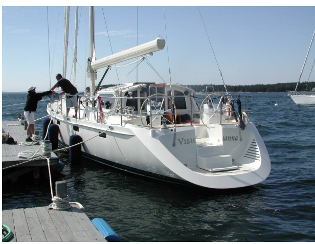
Fold down steps provide a walkthrough to the transom scoop.