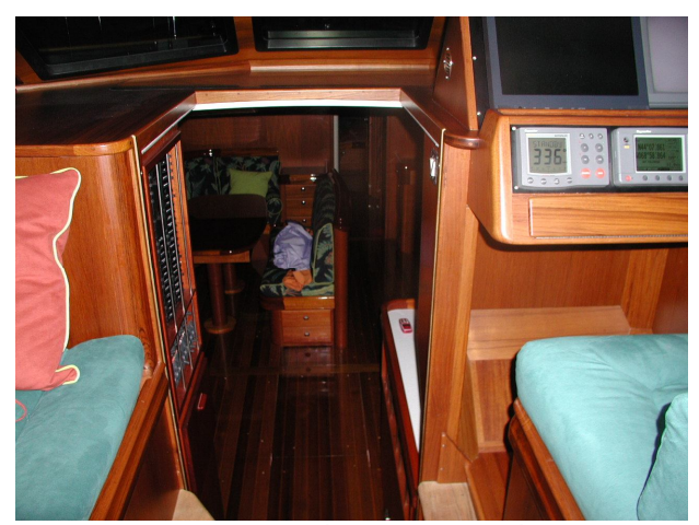
An inner companionway closure separates the pilothouse from the rest of the interior. The pilothouse may thus be used in very heavy weather and at night without disturbing those below.