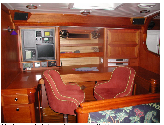
The home entertainment area opposite the dinette is beautifully crafted.