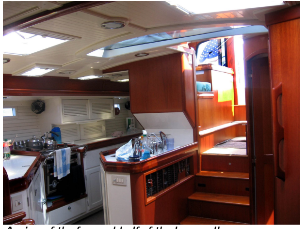
A view of the forward half of the large galley