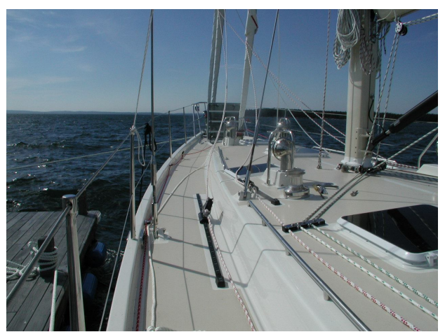
Wide side decks, stanchions emerging from the bulwark top, no wood anywhere to maintain.