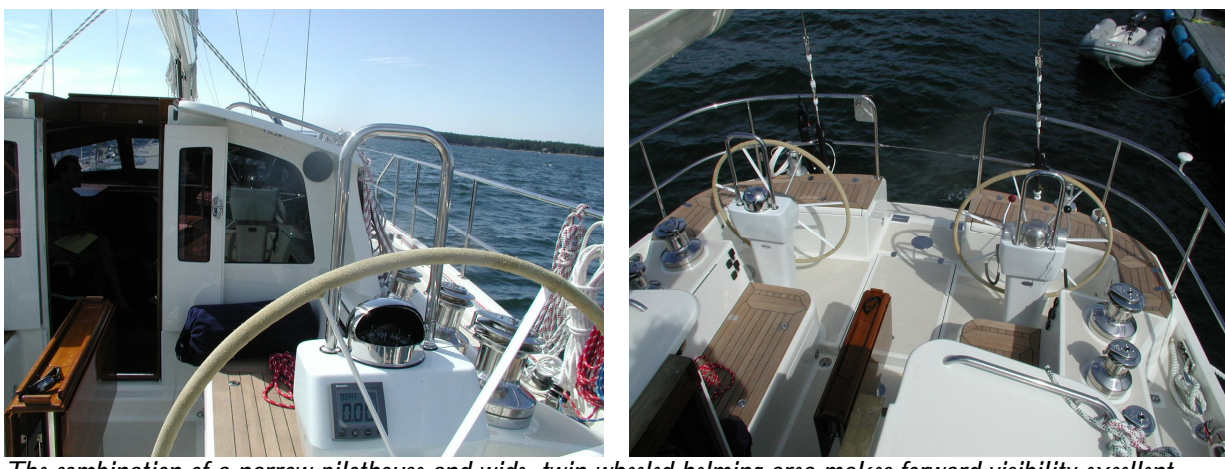
The combination of a narrow pilothouse and wide, twin wheeled helming area makes forward visibility excellent.