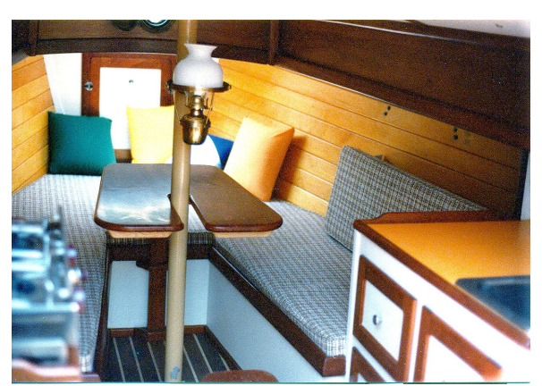
We finished them off to a very high standard. Too high.