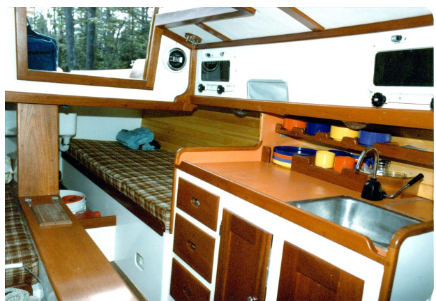
The centerboard trunk was off center a few inches to starboard, the companionway to port. It all worked out very nicely.

With all her compromises the BAHAMA SANDPIPER was still a fun little boat to sail once you got her off the trailer and into the water. If the day ever comes when we're growing our auto fuel in fields rather than mining it and not dumping wing-loads of carbon into the upper atmosphere flying to our next yacht charter, you'll see something very much like this in our campgrounds and shallow estuaries.