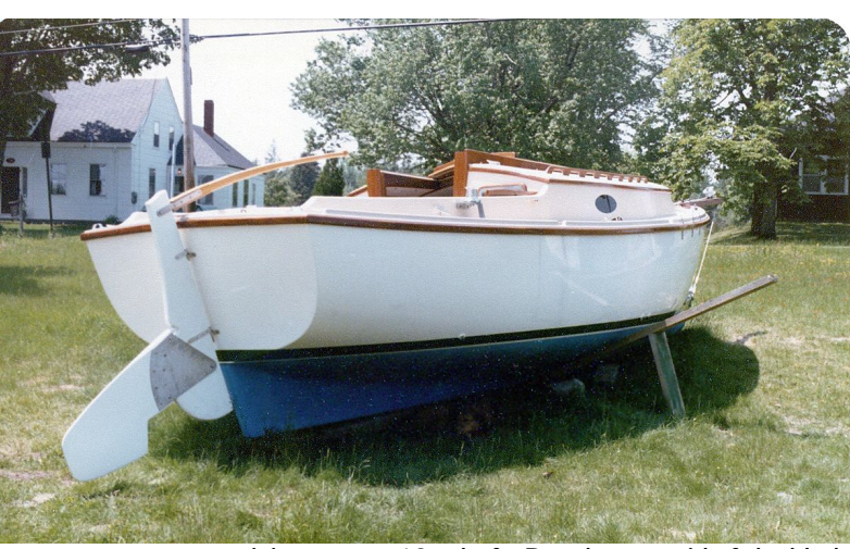
She was cute and fun to sail. The rudder swung up as you see, giving a mere 18" draft. But the centroid of the blade was so far from the pivot axis in this configuration that it was a bear to steer.