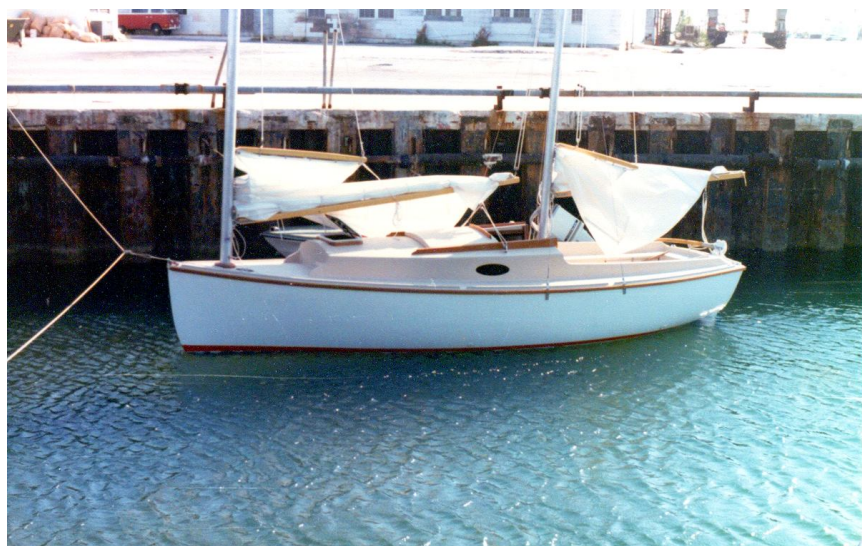
The cutter rig made the most sense, though the cat-ketch was the one that attracted attention.