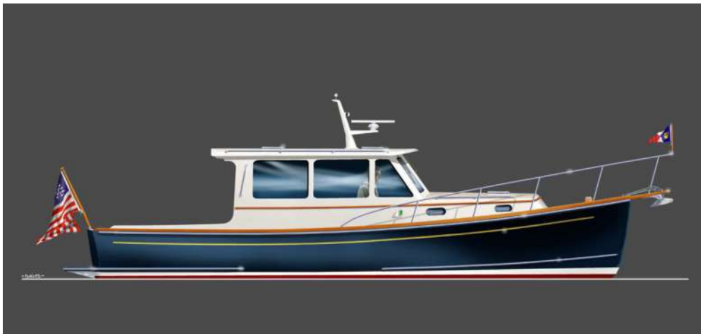
WEST BAY 37 AS RE-STYLED BY MARK FITZGERALD OF THE PAINE OFFICE