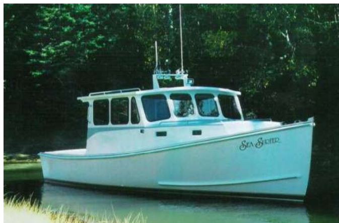
West Bay 31

West Bay Boats is located in a traditional coastal community east of Ellsworth, Maine. This is where the real "downeast" Maine begins. Upon reaching Steuben one discovers the skill and integrity and work ethic of Paul and Vaughn West. Their goal is to create a power yacht built to your specifications and crafted to the highest standards.